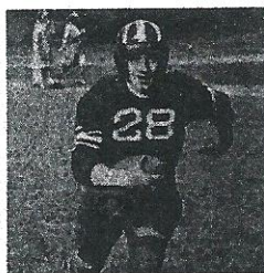
Gene Links Class of 1946